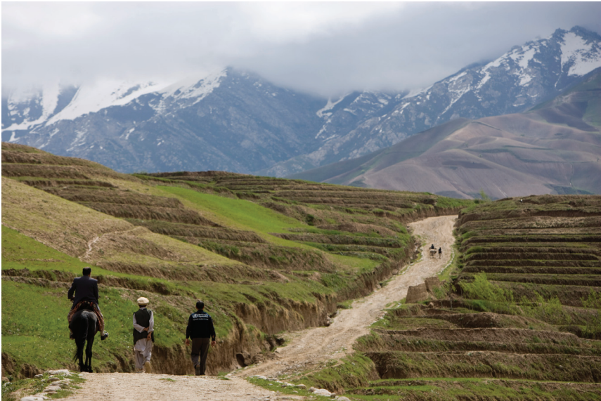
Bull World Health Organ 2010;88:566-567 | doi:10.2471/BLT.10.020810