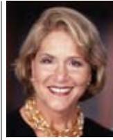
Judith Rodin President Rockefeller Foundation

Thank you for the privilege of joining you, and the honor of speaking at this remarkable gathering, during this critical time. It's a special treat to be with Your Royal Highness, to celebrate the long lineage and legacy of Thailand's global leadership – especially in the field of modern public health. I'm also delighted to return to Bangkok – a crucial center of Rockefeller Foundation work since 1917, when our forbearers first joined with Prince Mahidol to bring the benefits of public health to Southeast Asia.